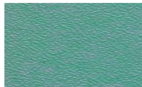
0651 | VERDE