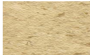
0650 | BEIGE