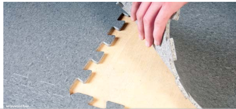
on plywood floor