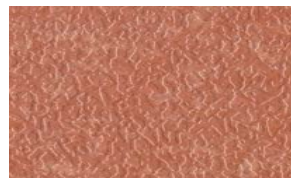
0652 | TERRACOTA