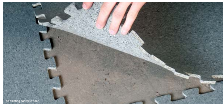
on existing concrete floor