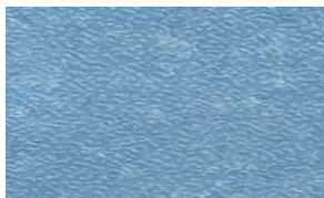
0654 | CELESTE

Therefore it's transportable and also easy to be removes whenever is needed.