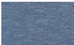
0653 | AZUL